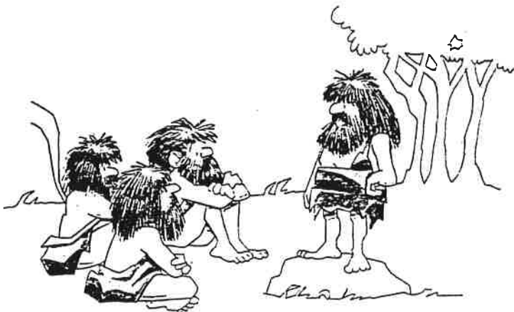
"First off, we should elect a permanent rockperson."