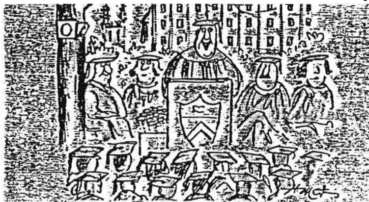
and finally, if things get too tough for you out there in the real world, scurry on back here and pick up

See page 3 announcement about Graduate School opportunities: